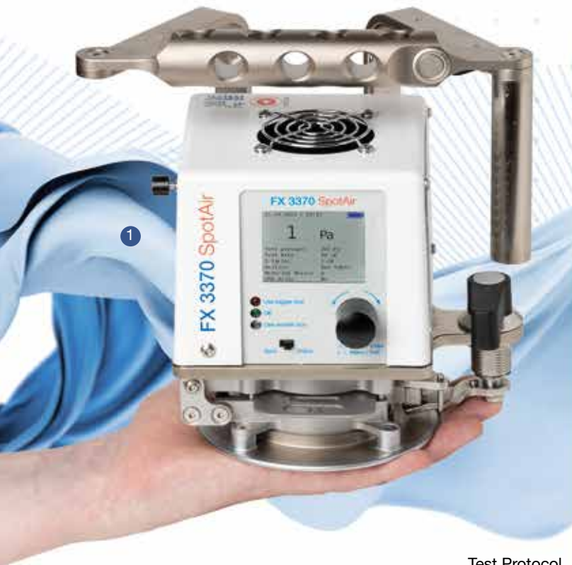
Test Protocol FX 3370 SpotAir

The supplied carrying case not only allows to move the instrument easily and safely within a plant, it also assists when it needs to be taken to a supplier or customer for measurements there.